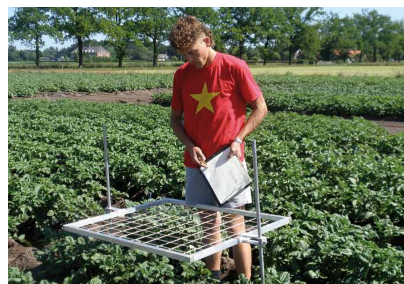
Foto 1. Ground cover measurement

Figure 1 illustrates the schematic ground cover curve (GCC) including its main parameters (Vx, T1, T2, and TE). We surmised that some of these parameters, or parameters calculated from these parameters (T2-T1 and Area Under Ground Cover Progress Curve, AUGCPC) could be correlated with nitrogen efficiency under low input conditions.