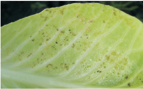
Figure 1. Damage caused by thrips feeding on a leaf from a cabbage head.

Thrips ( Thrips tabaci ) are an important pest on cabbage, in organic as well as conventional cultivation. In the Netherlands symptoms appear mostly in September-October and continue to develop during cold storage. Although large differences in susceptibility to thrips damage occur among cultivated varieties it is not clear if this is due to variation in resistance (affecting the thrips population) or tolerance (affecting symptom development upon thrips feeding). Also, little is known about plant traits affecting resistance or tolerance. We aim to elucidate these questions in this project.